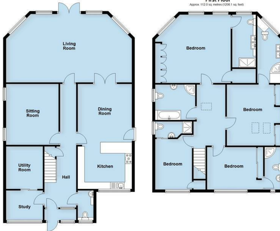
First Floor Approx. 112.0 sq. metres (1206.1 sq. feet)

Leamington Spa Office Somerset House Clarendon Place Royal Leamington Spa CV32 5QN